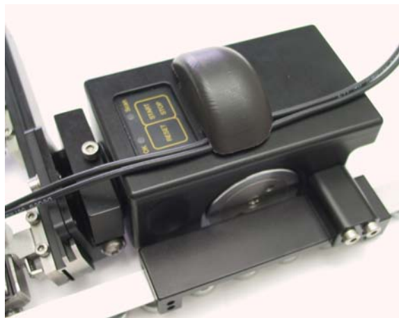
Hand support with integrated cable holder