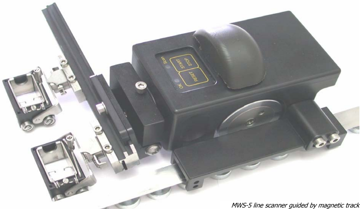
MWS-5 line scanner guided by magnetic track

The MWS-5 is a manually operated scanner, designed for line scanning, primarily in relation to A-scan recording, TOFD and corrosion mapping. With optional accessories, the scanner can be modified for use as a hand operated XY scanner or as an arm scanner with probe swiveling capability.